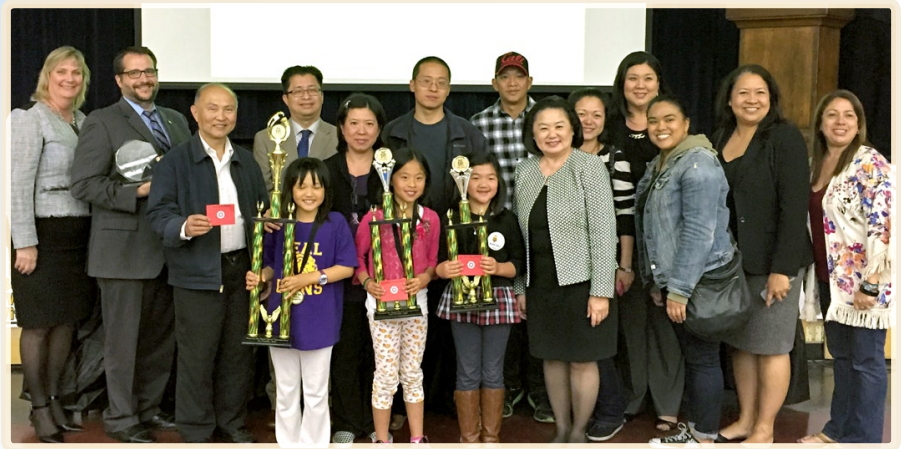
First District 3 rd Grade Math Bee Winners and District Staff