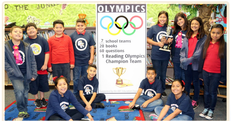
Furgeson ES - Winners of the 4 th Annual Reading Olympics

This year seven schools, Kennedy, Niemes, Palms, Hawaiian, Stowers, Melbourne, and Furgeson elementary schools competed on Saturday, February 27, 2016 at the Hawaiian Gardens Community Center. Each school had a team of 12 students (plus 2 alternates) from grades 4, 5, and 6. Each team collectively read all 20 books on the official book list. There were three rounds of questions in which team members collaborated on the answers and submitted their answers via electronic device to the judges. At the end of the competition, ribbons were awarded to each member of the teams based on the teams' total points, red, blue, or green. The top scoring school received the "Reading Olympics Grand Champion" trophy to be displayed at their school site. ▶